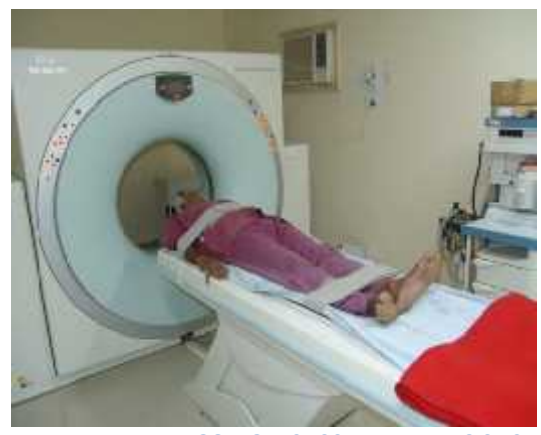
A PATIENT UNDERGOING A CT SCAN IN THE 16-SLICE WHOLE BODY CT SCANNER