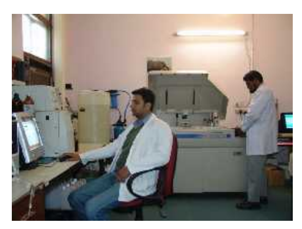
THE OLYMPUS AU680 AUTOMATED BIOCHEMISTRY